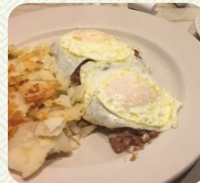
Corned Beef Hash & Eggs Served with home fries & buttered toast $13.45