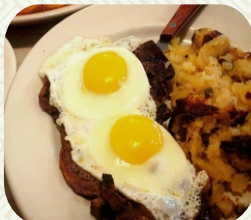
Steak & Eggs served with home fries & buttered toast $24.45