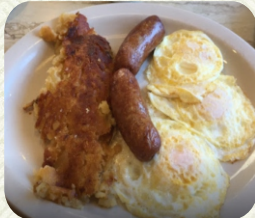
Two Eggs (any style) Served with choice of ham, bacon, sausage or taylor ham, home fries & buttered toast $11.95