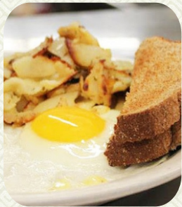
No.1 Two Eggs (any style) Served with home fries & buttered toast $8.45