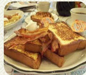
Pancakes or French Toast Served with choice of ham, bacon, sausage or taylor ham $12.45