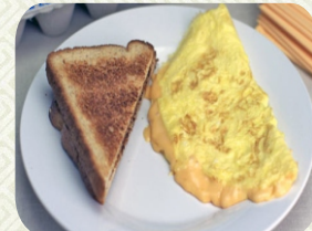
American Cheese Omelette Served with home fries & buttered toast $11.45