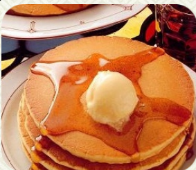
No.3 Pancakes or French Toast $8.95 whole wheat .50c extra